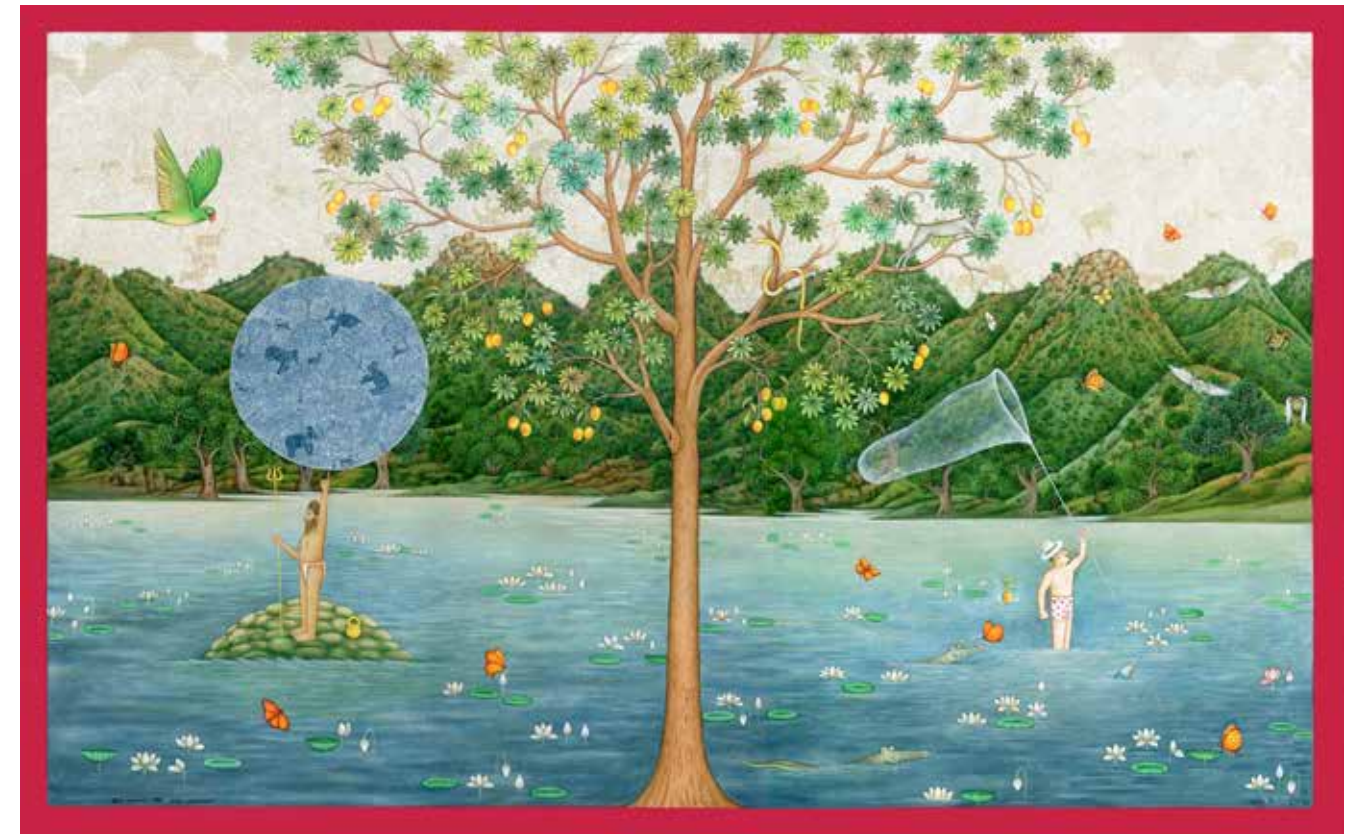
A Day of Possibilities, Gouache on wasli, 2018

Sometimes our work is dismissed as simply 'whimsical', but a closer look with a bit of thought always reveals a deeper meaning. In the work titled A Day of Possibilities that we made for the cover of this issue of Arts Illustrated , our oft-seen 'Everyman' (wearing a white fedora) 'fishes' for butterflies, knee-deep in a lake. He is oblivious to the practical need to catch fish, his mind probably filled with the desire for knowledge and specimens for evidence. Is he hoping for the fragility of a precious butterfly? Or does he seek the horned demons with white wings? A falling mango has nearly missed him, a viper is in the tree, and two crocodiles are dangerously near. It is a day of possibilities, and yet our protagonist is fixed upon only one of them. It is as if a self-imposed tunnel vision has left him almost sightless, to his own immediate dangers and a plethora of opportunities.