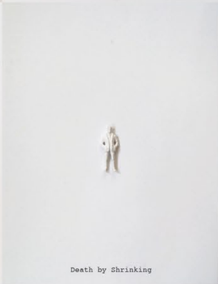
Death by Shrinking