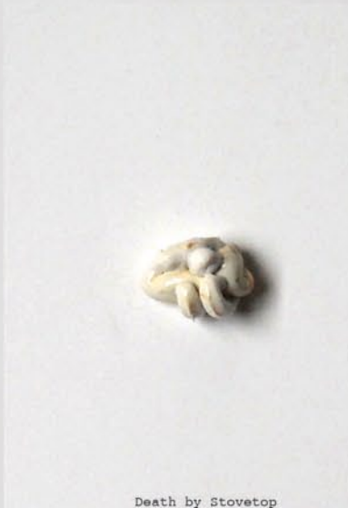
Death by Stovetop