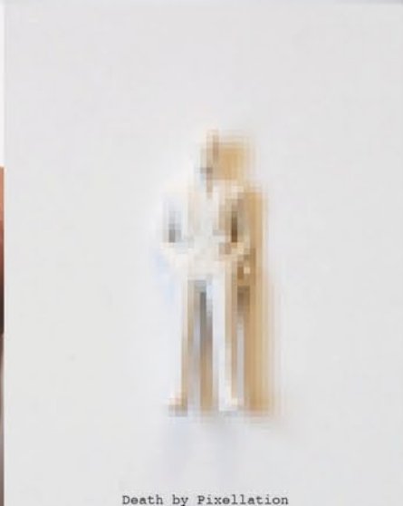
Death by Pixellation