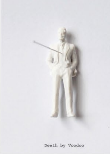
Death by Voodoo