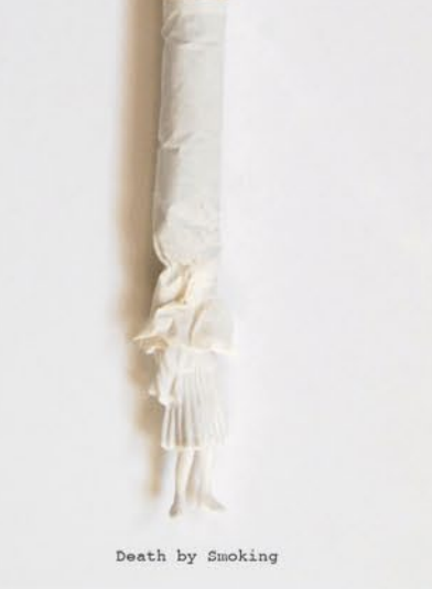
Death by Smoking