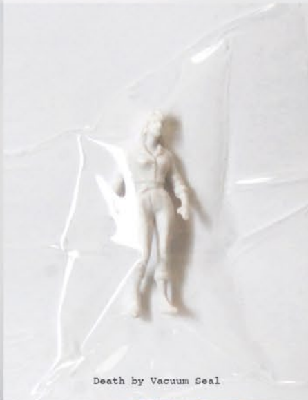
Death by Vacuum Seal