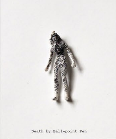
Death by Ball-point Pen