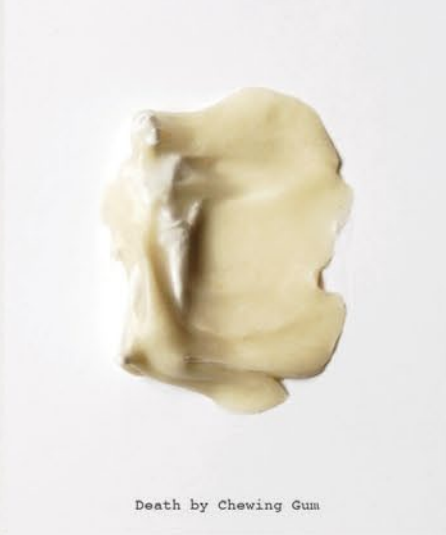
Death by Chewing Gum