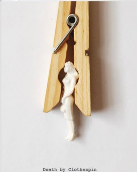
Death by Clothespin