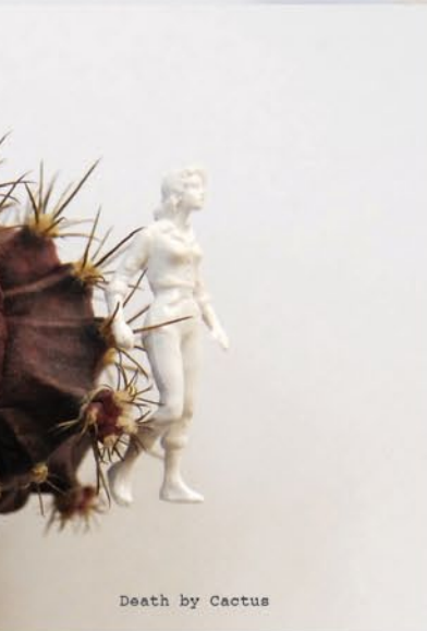
Death by Cactus