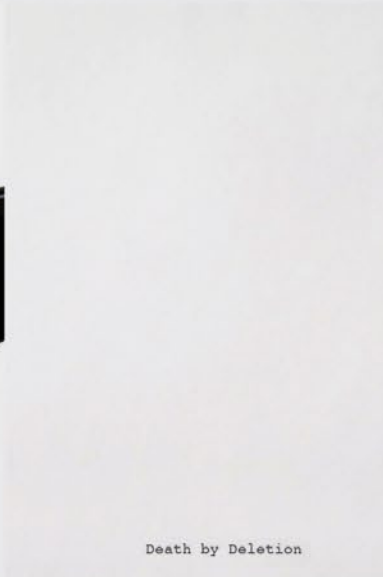
Death by Deletion