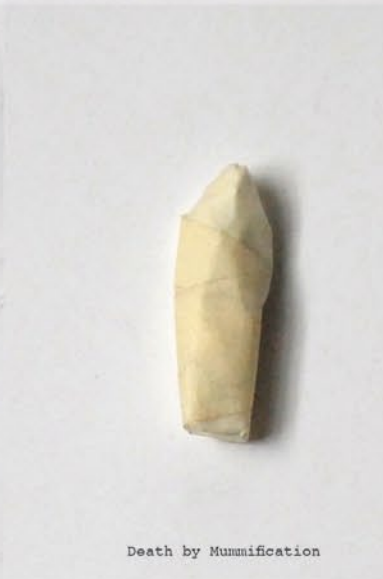
Death by Mummification