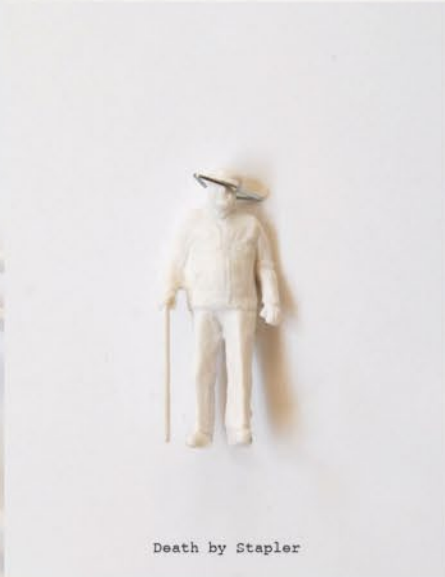
Death by Stapler