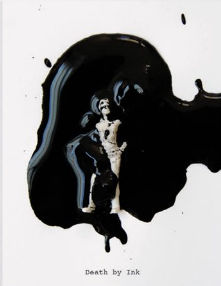
Death by Ink