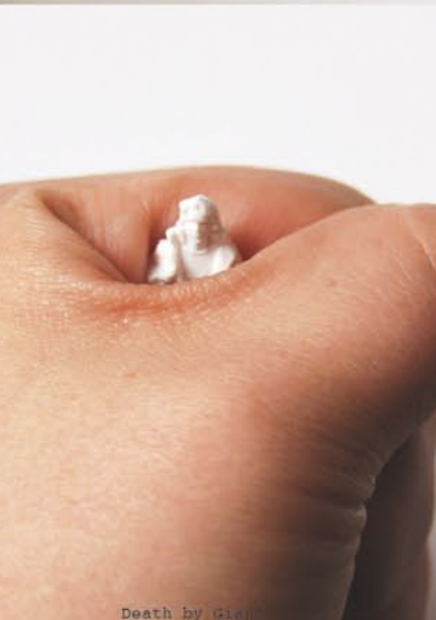
Death by Glass