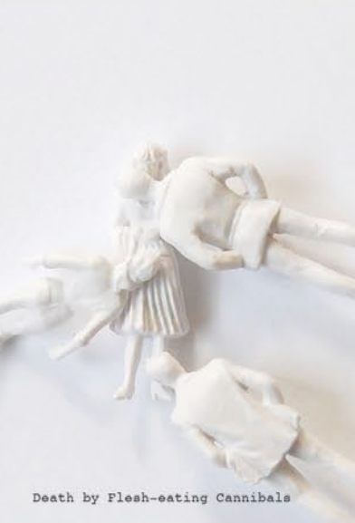
Death by Flesh-eating Cannibals